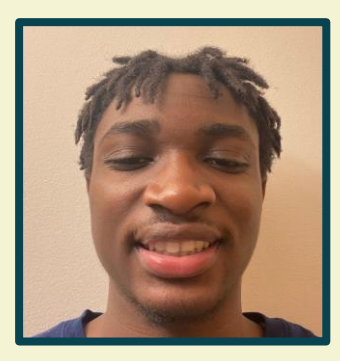
"[The program] was good. It opened my eyes and gave me a feel of what the professional world is like."